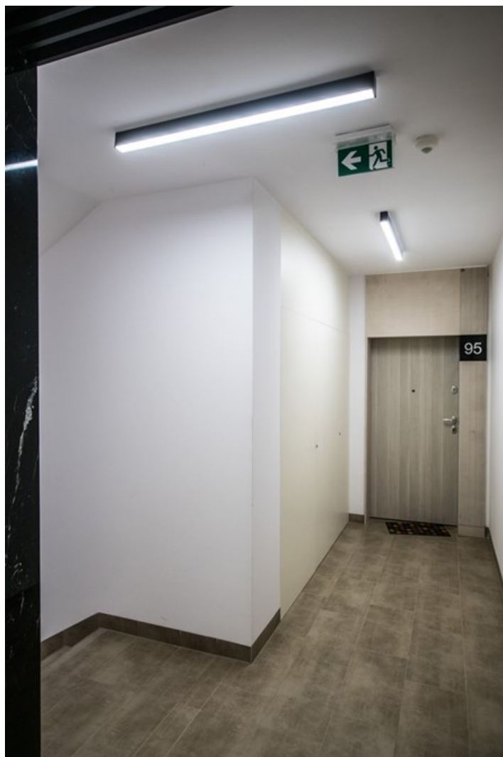
"Haven House" residential, Warsaw

The luminaire is made of aluminum profile. Comparing to the traditional X-Line LED, size of the luminaire has been reduced, and all construction has been closed in a narrow 48 mm profile, which gives now a more elegant form of the product. The X-Line Slim uses a lenses. All of this allows to manipulate light and create lighting systems, facilitating the creation of comfortable vision in the interiors and their aesthetic appearance. The X-Line Slim luminaire is designed for mounting on ceiling. The luminaire is equipped with LED modules adjusted to regulate the color temperature of light in the range from 2700 K to 6500 K.