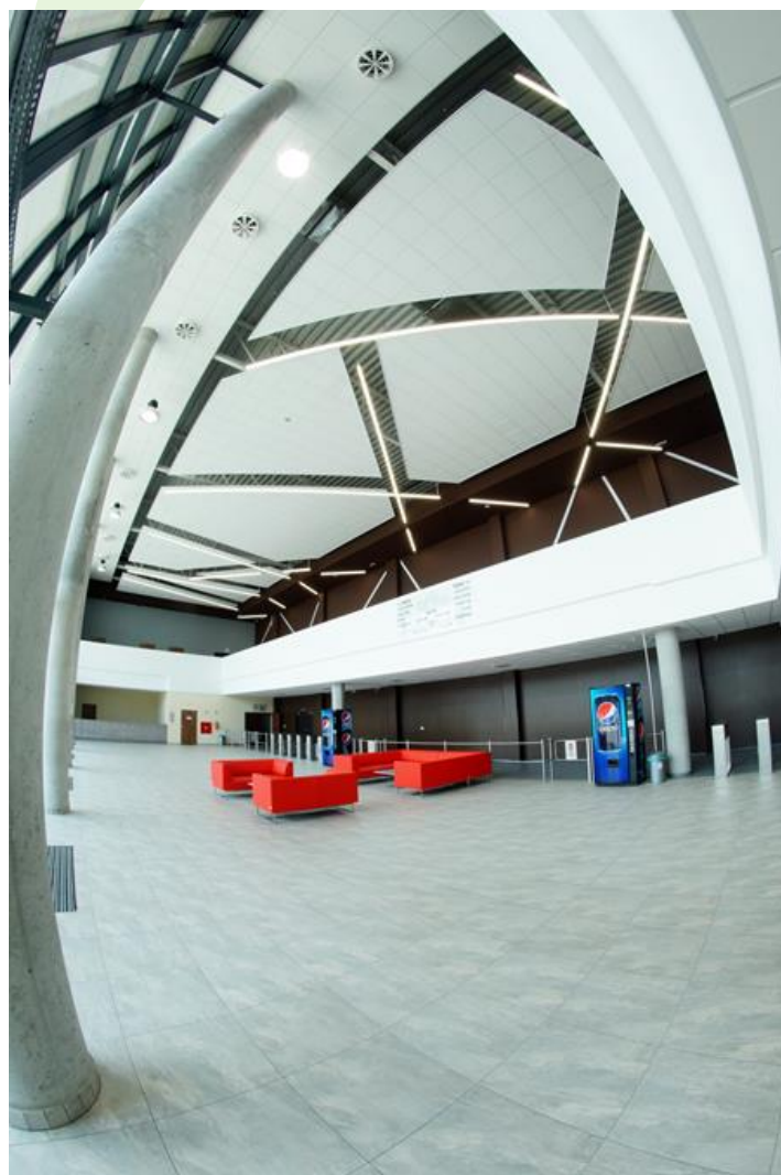
Trade Fair and Exhibition Center, Bydgoszcz

Light fitting made out of aluminium profile equipped with opal diffuser or MPRM and driver. X-LINE fittings are intended to be mounted on ceiling or pendants. In the family of X-LINE LED fittings modules of renowned brands are applied. The luminaire is equipped with LED modules adjusted to regulate the color temperature of light in the range from 2700 K to 6500 K.