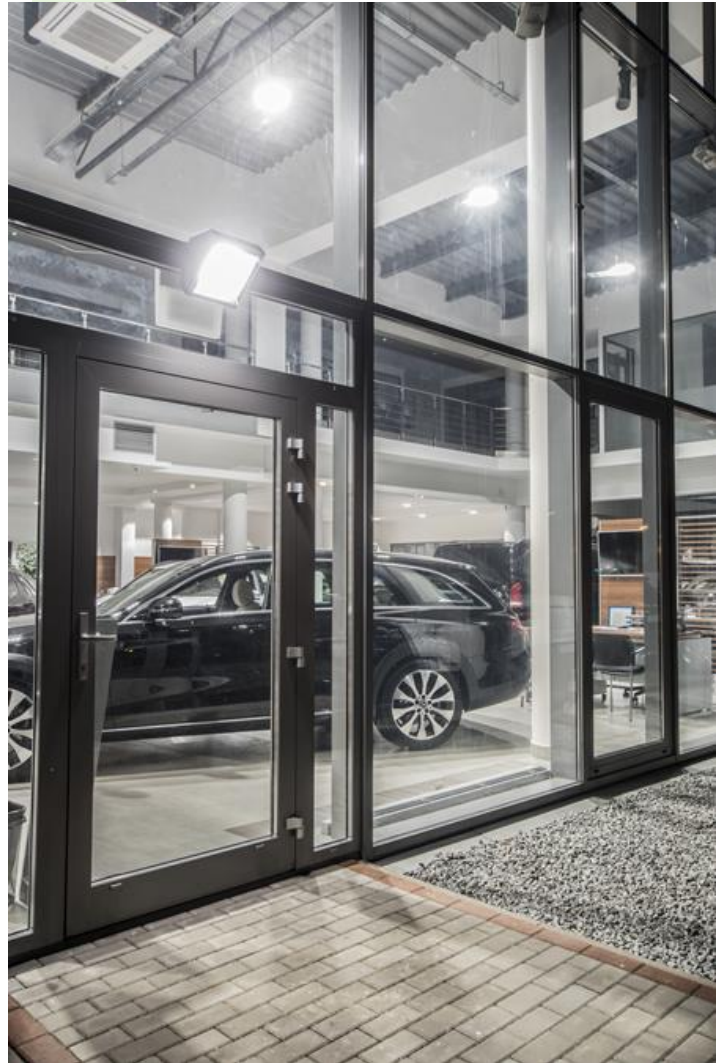
Auto Idea - Mercedes showroom, Białystok

Powder painted steel housing. Possibility of mounting emergency module. Isolated battery applied in luminaire is equipped with thermostat enabling performance in low temperature up to -20^{\circ} C. UPDOOR might be mounted on walls or ceilings and is recommended to illuminate buildings' entrances, arteries, tunnels, underground entrances, etc.