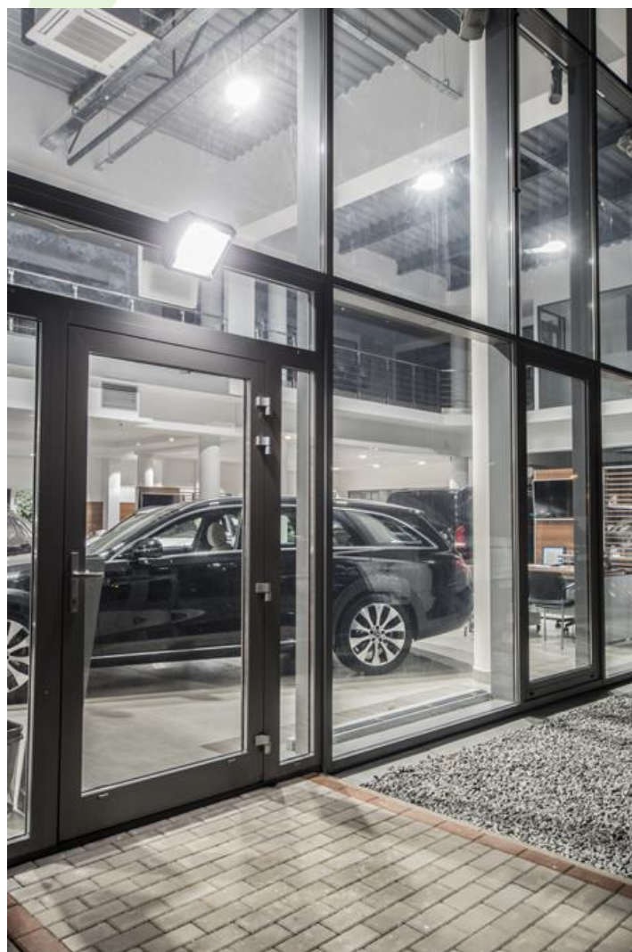
Auto Idea - Mercedes showroom, Białystok

Powder painted steel housing. Possibility of mounting emergency module. Isolated battery applied in luminaire is equipped with thermostat enabling performance in low temperature up to -20^{\circ}\text{C} . UPDOOR might be mounted on walls or ceilings and is recommended to illuminate buildings' entrances, arteries, tunnels, underground entrances, etc.