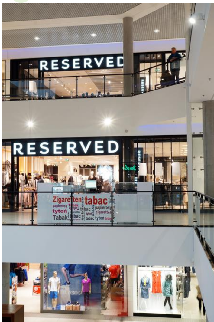
"Corso" shopping mall, Świnoujście

The TEAR LED luminaire is highly recommended for lighting the shop windows, shops' interiors, commercial spaces, the centers of culture and art – everywhere where the lighting emphasis is put on the singular items and attracts the customers attention. The luminaire is used for the highly efficient LED panels of the leading lighting companies. TEAR LED is adapted to be mounted on a three-phase track, or on ceiling by a ceiling base. The body is made from the aluminum cast. Colour: white or black.