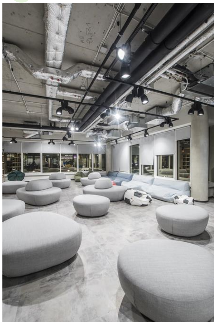
Alior Bank, Warsaw

The TEAR LED luminaire is highly recommended for lighting the shop windows, shops' interiors, commercial spaces, the centers of culture and art – everywhere where the lighting emphasis is put on the singular items and attracts the customers attention. The luminaire is used for the highly efficient LED panels of the leading lighting companies. TEAR LED is adapted to be mounted on a three-phase track, or on ceiling by a ceiling base. The body is made from the aluminum cast. Colour: white or black.