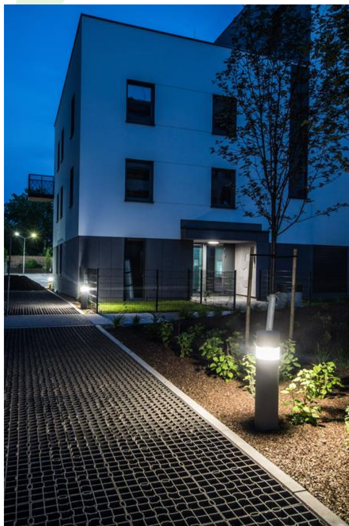
Osiedle na Woli, Warsaw

Outdoor luminaire to be mounted on hard surface (concrete, sett blocks or foundations) equipped in the latest generation, highly efficient and energy saving LED sources. Aluminium made housing is corrosion resistant. Product is designated to efficient illumination of walking paths, parks, recreational areas, residential areas. Level of protection against penetration of dust, moisture and solids: IP65