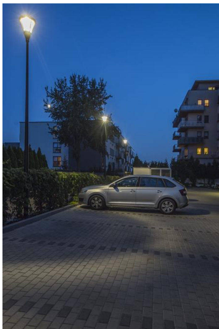
"Jardin Bemowo" residential, Warsaw

Outdoor luminaire dedicated for garden and parks, equipped with highly efficient LED sources. Body made from aluminum cast. Its transparent diffuser is made from polycarbonate which is highly resistant to mechanical factors – IK09. The outer cover provides a very high level of resistance to all atmospheric factors, as well as the luminaire aesthetical design during the whole exploitation process (IP54). Mounting diameter – 76 mm. Luminaire specially recommended to illuminate the squares, parks, and other open spaces.