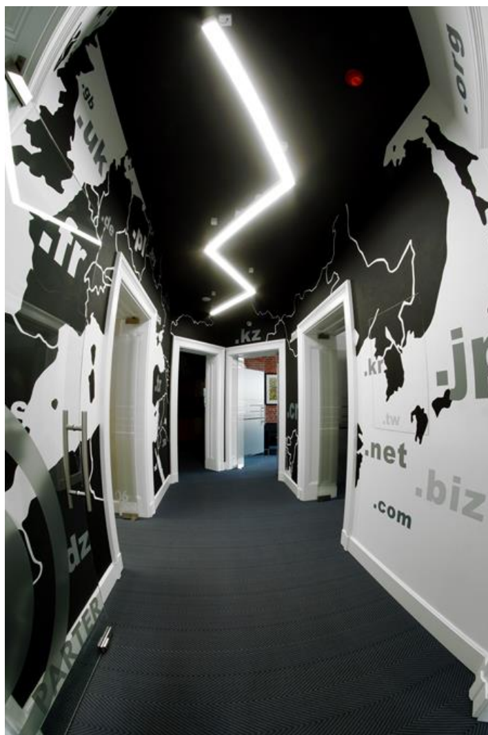
Domena.pl offices, Bydgoszcz

Luminaire equipped with the highly efficient LED source. Body made from aluminum profile. Optical system provides regular light distribution on diffuser. There are two kinds of diffusers available: opal and PMMA micro-prism. Luminaire adapted to be mounted on suspensions or directly on a solid ceiling construction. The suspended version is equipped with the suspension system which is 1500 mm long, and has the smooth regulation of the suspension length. These luminaires may be dedicated to decorate the representative places such as: entrances, receptions, restaurants, halls, etc.