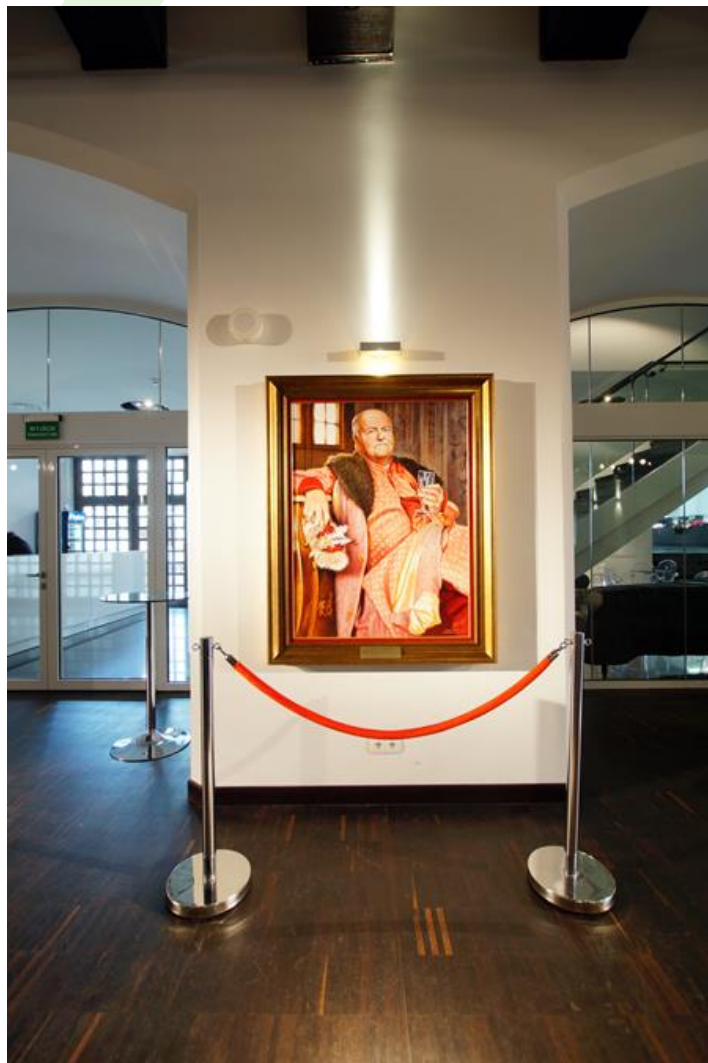
Opera on the Castle, Szczecin

Aluminum made luminaire. Thanks to applied lenses of renowned producers there is possibility to arrange luminous flux UP/DOWN. MINI WALL C LED UP&DOWN is recommended to be installed as a decorative and accent lighting.