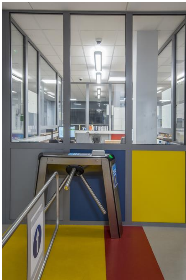
Family swimming pool, Białystok

We believe that the advantages of applying specific luminaires in public buildings depend mainly on their lighting properties. Their design should be simple and shouldn't capture attention. Lighting well designed builds friendly atmosphere, considers luminaires with high efficiency, gives comfort and creates most favourable conditions for people. Suspended, decorative luminary of indirect-direct light distribution. Is characterized by high lighting parameters and subtle construction. Casing of the luminary is made of powder-painted steel sheet. Grey is a standard colour of the luminary. Significant diversity of the value of luminous flux. Colour rendering index CRI: 80. The luminary perfectly matches interior design of representative facilities.