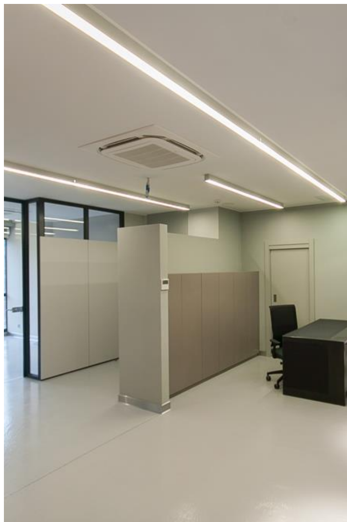
Zymek Chancellery, Katowice

Luminaire to be mounted on suspensions, or directly on solid ceiling construction. The suspended version is equipped with 1500 mm long suspension system that includes smooth regulation of the suspension length. Its body made from anodized aluminum profile. Luminaire is equipped with highly efficient LED sources. Its diffuser is made from white polymethyl methacrylate with a light transparency more than 70%. Optical system creates Lambert diffuse reflection. No frame diffuser is equipped with specially formed latches that match the aluminum profile. Luminaire is resistant to solids, dust, and humidity penetration – IP20.