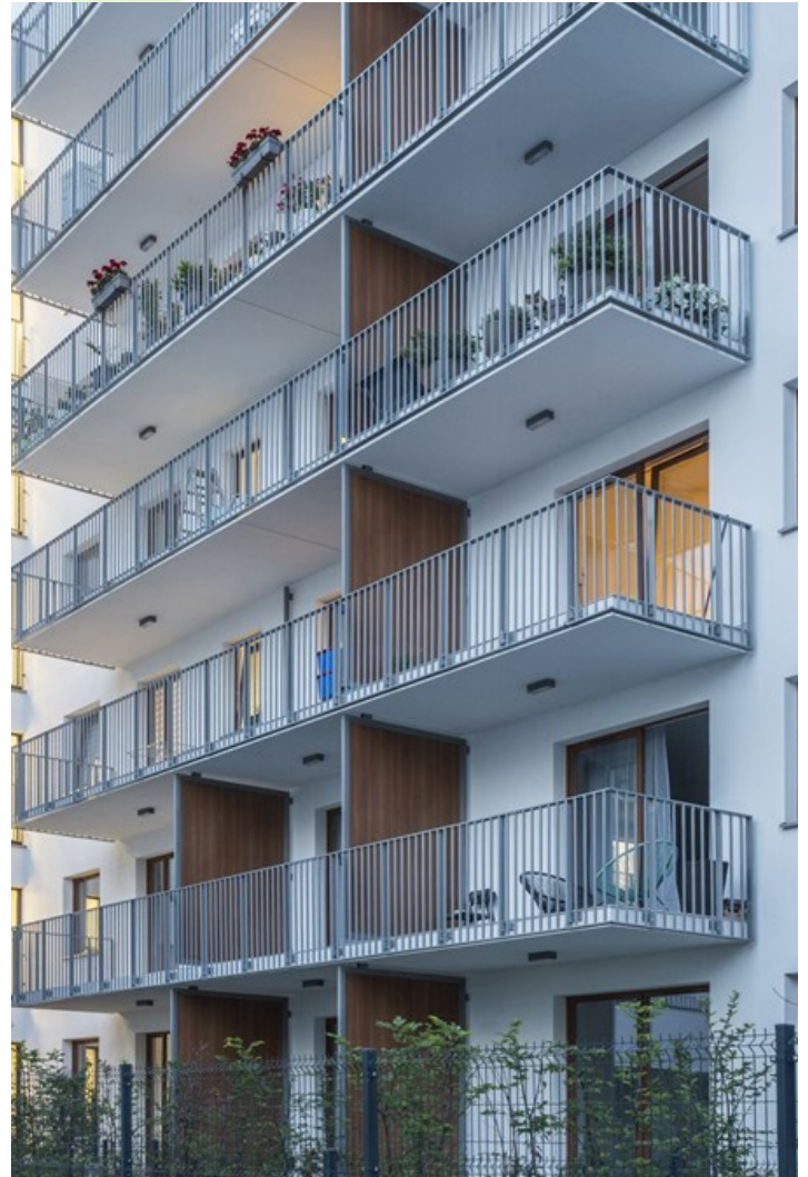
"Awangarda" house, Warsaw

Luminaire for interchangeable light sources so called Retrofit suitable for E27 frame. The body is made of aluminum. PMMA milky colour diffuser. Very easy mounting and access to the interior of the luminaire. Wall mounting (Online Kinkiet) or ceiling mounting (Online Surface).