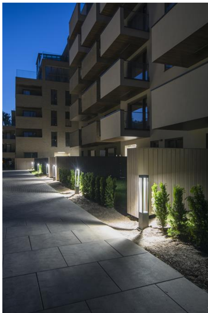
"Awangarda" residential, Warsaw

Openwork construction with big notches of side planes which creates impression of lightness. Hermetic LED module with an integrated lens which ensures four-way, symmetrical light distribution. Mounting in the substrate on the specially designed foundations. Available to the customer request an option with luminous flux reduction or dimmable DALI. Application: illumination of walking paths, parks, recreational areas, residential areas, gardens, allotment gardens. The level of protection against penetration of solid substances, dust and moisture is: IP65.