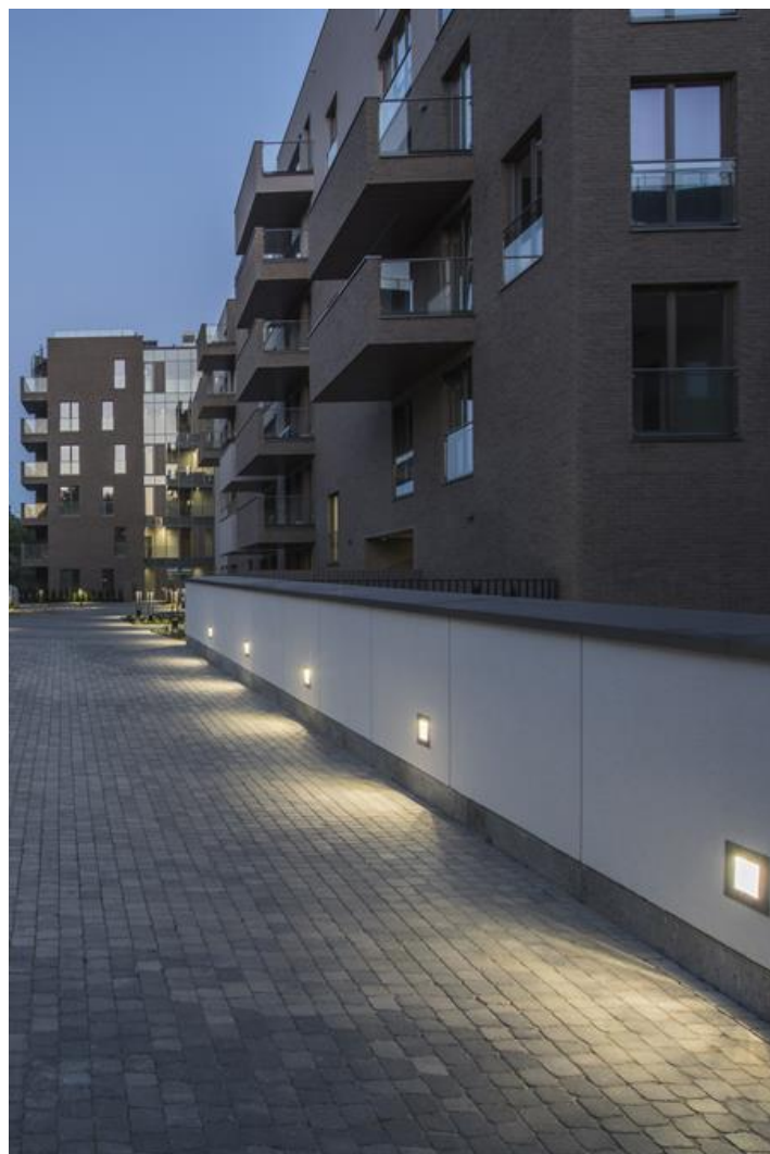
"Awangarda" residential, Warsaw

An outdoor fitting made for illuminating building facades and creating lighting effects. Mounting in the wall using assembly box included in the set. The body is made of aluminum painted with special facade paint which is resistant to bad weather conditions. Energy-efficient fitting made of component parts produced by renowned companies. It is possible to use various LED colours at the request of a customer. Ergonomic shapes of the fitting enable the application of the Kubik IN LED type fitting almost in every building. The assembly is very easy. The fitting is featured by a high level of protection against the penetration of solids and water: IP65, which renders the fitting an interesting decorative solution highlighting the architecture of an illuminated building.