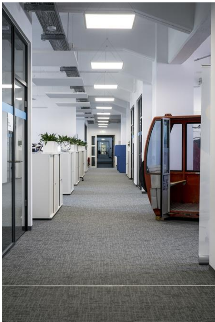
Lufthansa Systems, Berlin

Modern LED panel for installation on the slings. Equipped with the highly efficient LED sources. Luminary body made from aluminum. PMMA opal diffuser. Colour of luminary - white. CRI>80. Luminary dedicated for the public use structure like offices, conference rooms, classrooms, lecture halls etc. The manufacturer informs that during the work of the luminary visible deformations of the luminary from the horizontal plane within +/- 6 mm are permissible. This is due to the natural phenomenon of thermal expansion of materials and its own weight. If you need to maintain greater flatness tolerances, please contact our sales representative to choose the right lighting solution.