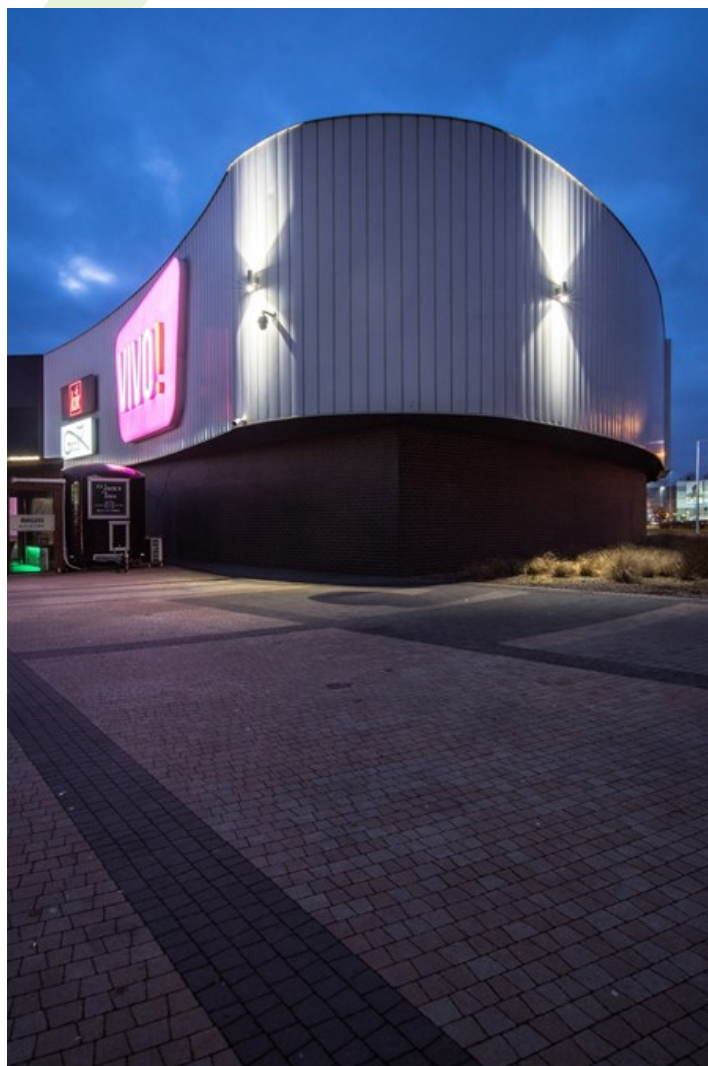
VIVO! Shopping Mall, Piła

Luminaire adapted to be mounted on walls. High lighting efficiency LEDs were used. Its body is made from anodized aluminum profile. It is resistant to solids, dust, and liquids penetration – IP65. This type of luminaire is recommended for decorative or accent illumination of buildings.