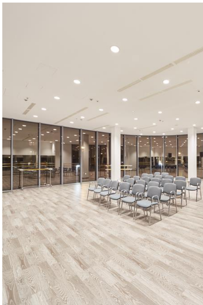
Cultural Center, Kozienice

Aluminum cast housing. This technology significantly increases possibility of application of particular luminaire due to lower ceiling load since additional cooling radiator is not required. Beryl New LED O has higher efficiency and efficiency than the previous version. Luminaire is dedicated for prestigious interiors such as hotels, banks and offices of higher standard. Owing to the newest components and renowned producers of LEDs applied it was possible to build such luminaires which save energy consumption comparing with traditional solutions.