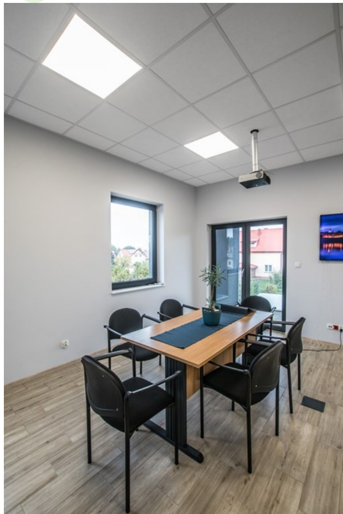
"Elclim" office, Toruń

Modern LED panel dedicated to be mounted on suspended modular ceilings, cardboard suspended ceilings (using adaptive frame), directly on the ceiling (using adaptive frame) or using adaptive frame and suspensions. Equipped with the highly efficient LED sources. Direct light distribution. Luminary body made from steel sheet. PMMA opal diffuser. Colour of luminary - white. CRI>80. Luminary dedicated for the public use structure like offices, conference rooms, classrooms, lecture halls etc.