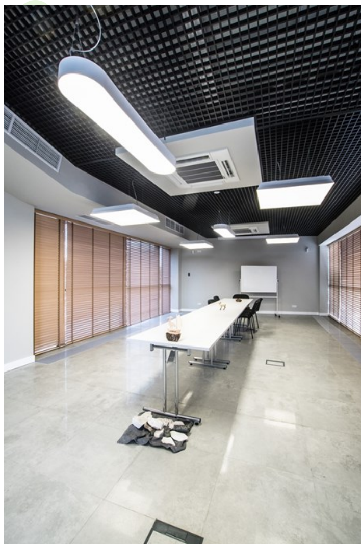
"Stara Łaźnia" art Gallery, Suwałki

Modernistic architectural luminaire in shapes of popular geometrical figures and fashionable design of simple form. The luminaire is adjusted to be mounted on slings. It is equipped with highly efficient LED light sources. Various options of luminous flux and colour temperature are available. The sides of the shade are made of thin-walled aluminium profile. In combination with a possibility of painting according to RAL palette, the luminaires allow to achieve a unique arrangement of various premises. Perfectly even surface-emitting is made of material which has very good light transmittance factor and has good diffusion parameters. This luminaire is dedicated to room of high stylistic requirements. It is perfect for hotel atrium, office receptions, architectural studios, conference rooms or halls and corridors in exclusive buildings as well as for theatres or modern shops in shopping centres.