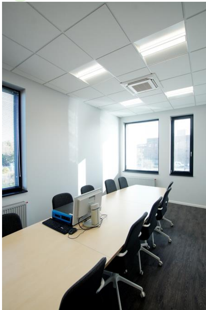
Printing house "Print Group", Szczecin

Luminary body made from steel sheet powder coated in white. Luminary adapted to be mounted in 600x600 module ceilings and with adaptive frame in plasterboard ceilings. It is equipped with highly efficient LED sources of the newest lighting generation, with the average durability of 60000 h. Diffuser is made from polymethyl methacrylate with micro prism structure (micro prism part of diffuser is the outer side of the luminaire). Luminaire resistant to solids, dust, and liquids penetration (IP20).