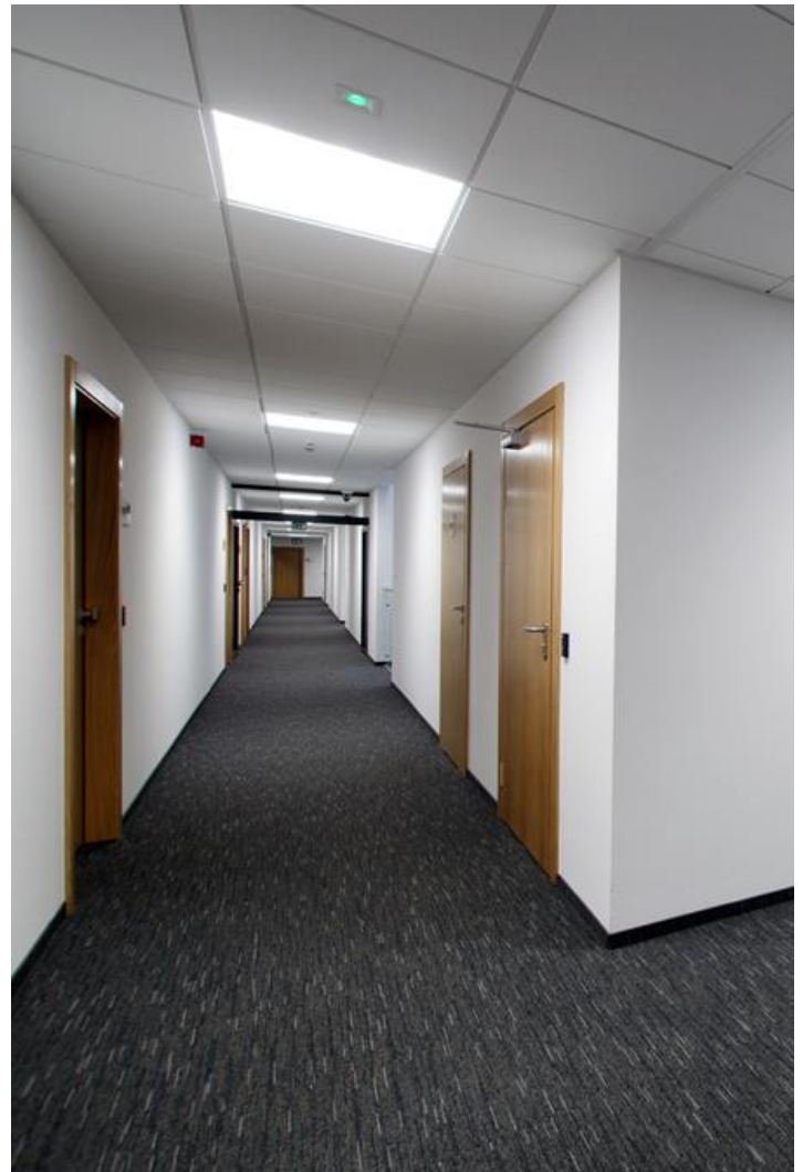
National Research Institute, Warsaw

Luminary adapted to be mounted on 600 x 600 mm module ceilings. It is equipped with highly efficient LED sources of the newest lighting generation, with the average durability of 60000 h. Diffuser is located in a steel frame which is powder coated in white. The frame is mounted to the luminary body by the use of springs. There is no need to use any extra tools to mount or dismantle the luminaire. The body is made from steel sheet which is powder coated with mixture of thermostatic synthetic resin, hardeners, and pigments, all resistant to UV radiation. Luminary resistant to solids, dust, and liquids penetration (IP20/44).