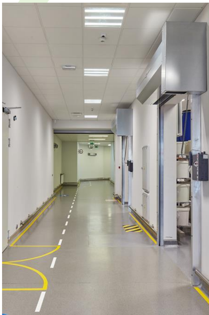
Cosmetics laboratory Dr Irena Eris, Piaseczno

Luminary designed to module suspended ceilings. Light distribution made by using high performance lenses. Luminary body made from steel sheet, powder coated in white. Luminary recommended for: emergency departments, intensive care units, and treatment rooms.