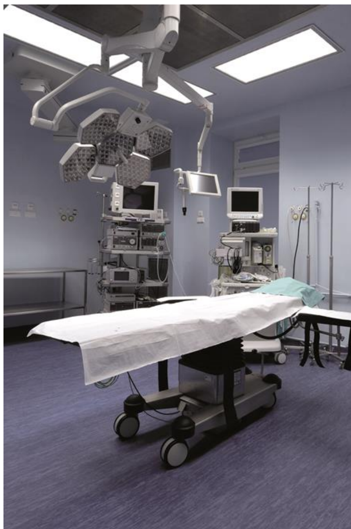
Międzyleski Specialist Hospital, Warsaw

Luminary is recommended to be used in medical sector to illuminate such premises as: operating rooms, rooms designed for laparoscopic and endoscopic, surgeries and interventions, recovery rooms, dermatological offices and to illuminate blood collection centres, etc. Luminary designed to module suspended ceilings, equipped with the highly efficient LED panels. Luminary body made from steel sheet, powder coated in white. This product is manufactured in production plant which holds quality management system for medical devices ISO 13485.