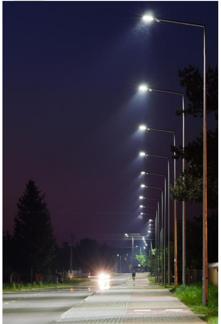
Polna street, Kodeń

Powder painted aluminum cast housing highly weather proof. Luminaire is equipped with adjustable handle designed for mounting on posts and arms of 60 mm diameter. Level of tightness IP66. Diffuser is made of hardened glass. Following color temperatures are available: 5700 K.