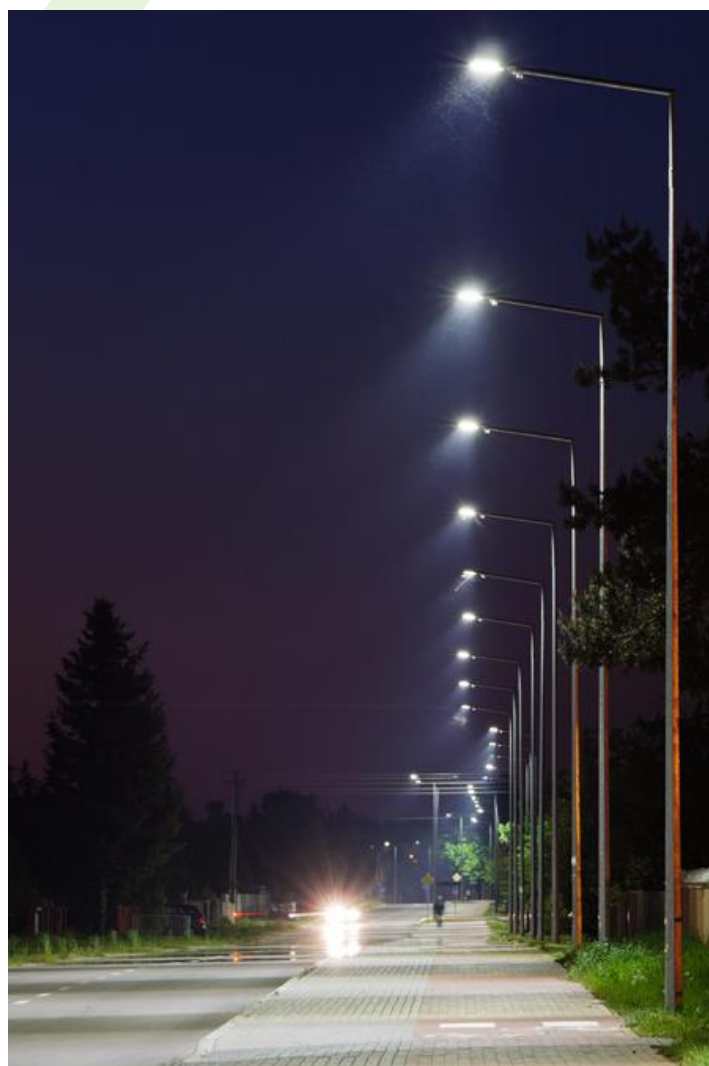
Polna street, Kodeń

Powder painted aluminum cast housing highly weather proof. Luminaire is equipped with adjustable handle designed for mounting on posts and arms of 60 mm diameter. Level of tightness IP66. Diffuser is made of hardened glass. Following color temperatures are available: 5700 K.