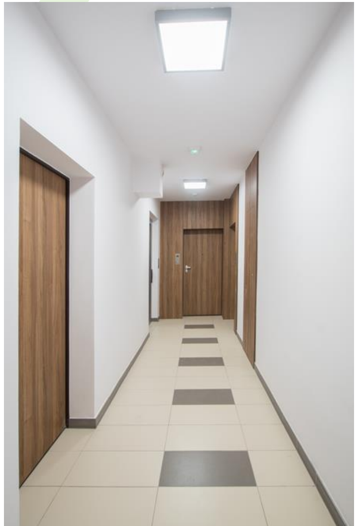
"Grójecka 216" apartments, Warsaw

Surface mounted luminaire for LED sources. Luminaire body made from steel sheet, powder coated. Luminaire recommended for: wards and hospital bathrooms.