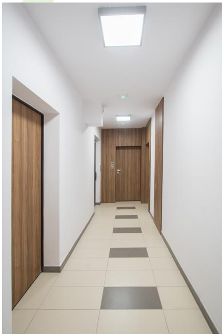
"Grójecka 216" apartments, Warsaw

Surface mounted luminaire for LED sources. Luminary body made from steel sheet, powder coated. Luminary recommended for: wards and hospital bathrooms.