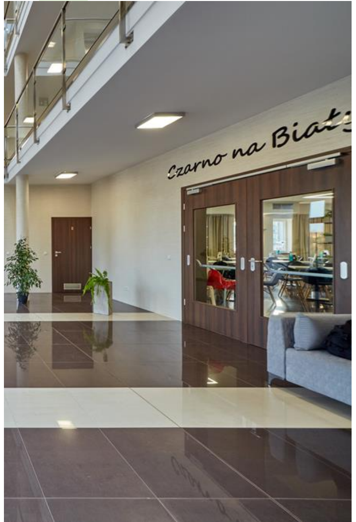
"Czarno na białym" hotel, Cracow

Surface mounted luminary for LED sources. Luminary body made from steel sheet, powder coated. Luminary recommended for: wards and hospital bathrooms.