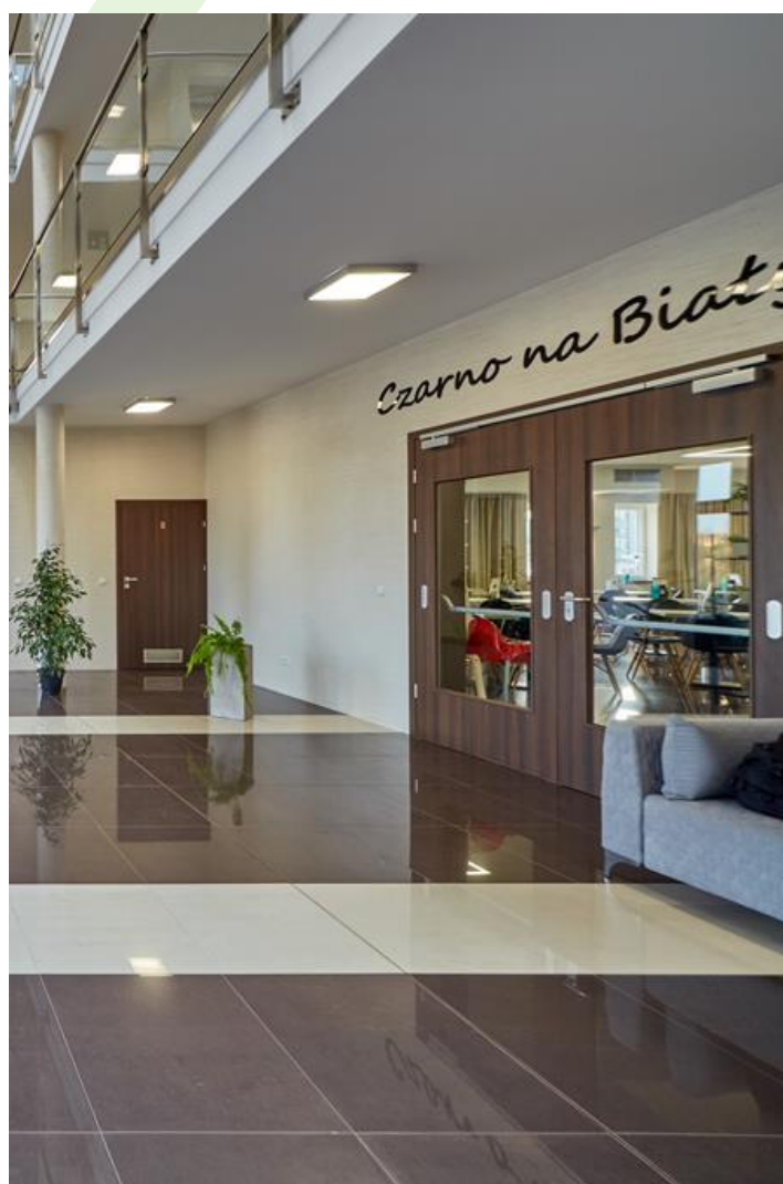
"Czarno na białym" hotel, Cracow

Surface mounted luminaire for LED sources. Luminaire body made from steel sheet, powder coated. Luminaire recommended for: wards and hospital bathrooms.