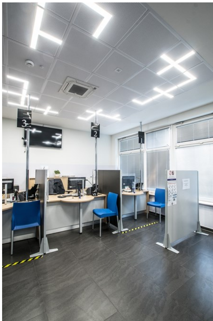
National Health Care office, Szczecin

System dedicated for 600 x 600 module suspended ceilings. It has a module and segment construction that includes the simple element, the curve, +-shaped element, L-shaped element and T-shaped element. Combination of these elements provides unlimited possibilities of interior lighting arrangement. It is possible to combine the lighting functionality and unique aesthetics of the interior. The location of segments can be altered any time by turning particular plaster boards. Owing to the color diffusers or LED RGB strips it is possible to obtain some extra color effects. The LED system can be easily dimmed what provides some extra energy savings.