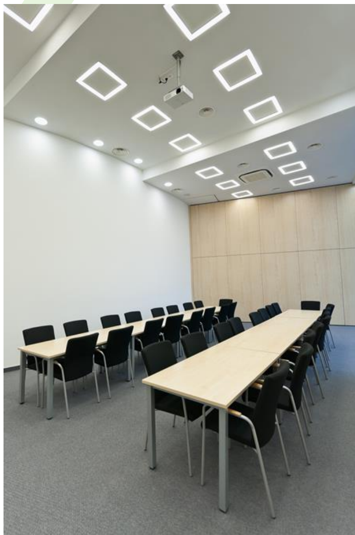
Mercedes showroom, Stryków

LED luminaire dedicated to be mounted on suspended modular ceilings or cardboard suspended ceilings (using adaptive frame). Housing made of steel sheet. Standard colour of the luminaire is white (RAL 9016). Luminaire available in PLX diffuser. Colour rendering index CRI: 80.