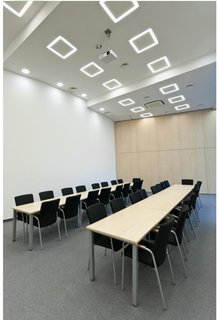
Mercedes showroom, Stryków

LED luminaire dedicated to be mounted on suspended modular ceilings or cardboard suspended ceilings (using adaptive frame). Housing made of steel sheet. Standard colour of the luminaire is white (RAL 9016). Luminaire available in PLX diffuser. Colour rendering index CRI: 80.