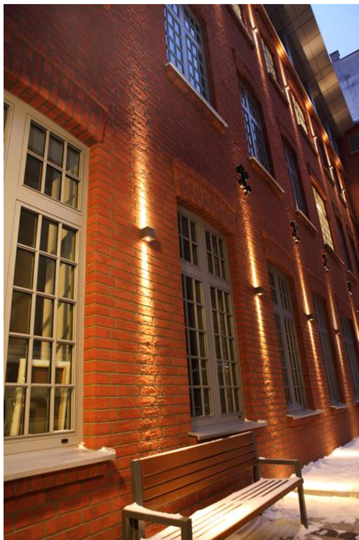
University of Ecology and Management, Warsaw

An outdoor fitting made for illuminating building facades and creating lighting effects. The body is made of aluminum painted with special facade paint which is resistant to bad weather conditions. Energy-efficient fitting made of component parts produced by renowned companies. It is possible to use various LED colours at the request of a customer. Ergonomic shapes of the fitting enable the application of the Kubik-type fitting almost in every building. The assembly and accessibility of the internal parts are very easy. The fitting is featured by a high level of protection against the penetration of solids and water: IP65, which renders the fitting an interesting decorative solution highlighting the architecture of an illuminated building.