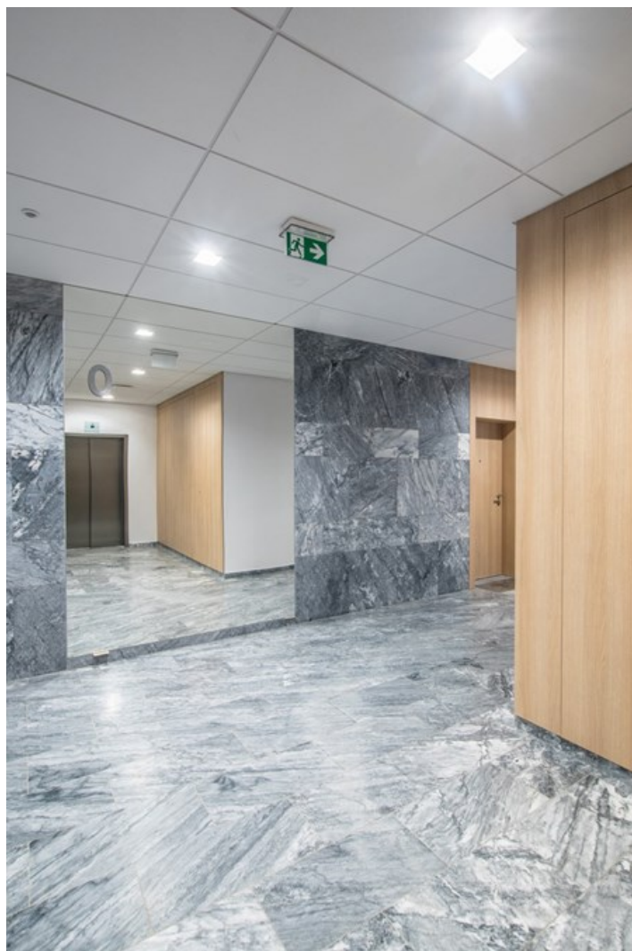
"Nova Królikarnia" residential, Warsaw

Aluminum cast housing. This technology significantly increases possibility of application of particular luminaire due to lower ceiling load since additional cooling radiator is not required. Beryl New LED K has higher efficiency and efficiency than the previous version. Luminaire is dedicated for prestigious interiors such as hotels, banks and offices of higher standard. Owing to the newest components and renowned producers of LEDs applied it was possible to build such luminaires which save energy consumption comparing with traditional solutions. The luminaire has the ability to adjust the optics in two planes (in the vertical axis by 359° and to the left and right 15°). Note: the color of the frame and housing has a slightly different shade than the color of the inner reflector cover.