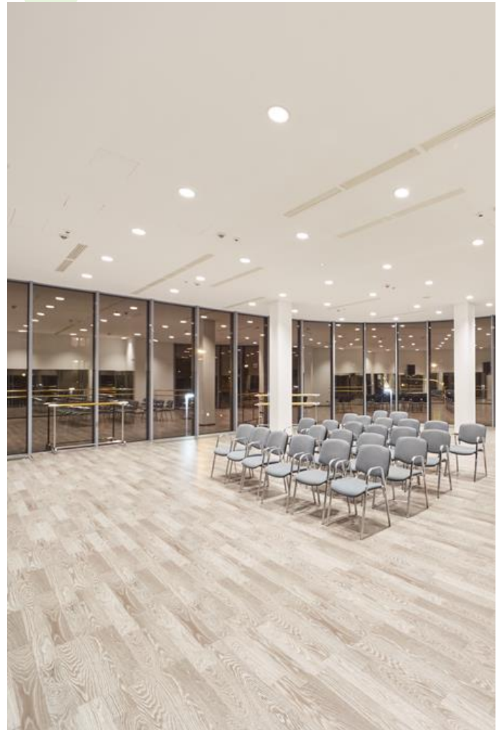
Cultural Center, Kozienice

Aluminum cast housing. This technology significantly increases possibility of application of particular luminaire due to lower ceiling load since additional cooling radiator is not required. Luminaire is dedicated for prestigious interiors such as hotels, banks and offices of higher standard. Owing to the newest components and renowned producers of LEDs applied it was possible to build such luminaires which save energy consumption comparing with traditional solutions.