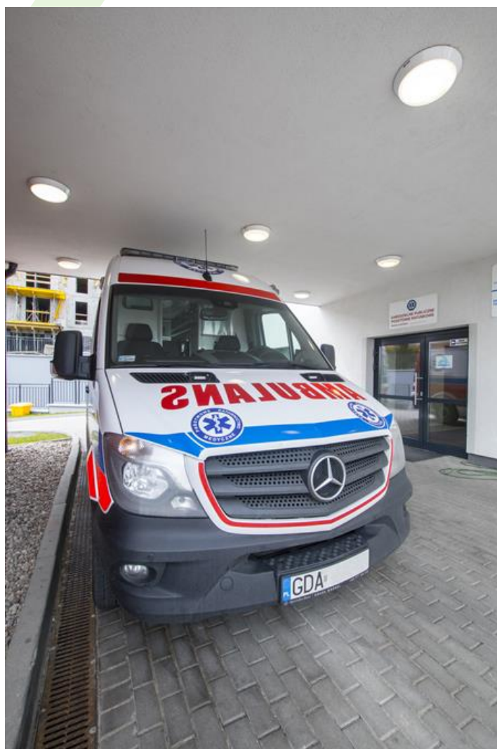
Emergency Medical Services, Pruszcz Gdański

Surface mounted or wall luminary equipped in highly efficient LED panels. Luminary body and diffuser made from IK10 impact resistant material. High level of protection against penetration of dust and water - IP65. Luminary recommended for: bathrooms, wards, medical staff room.