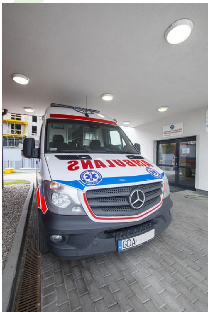
Emergency Medical Services, Pruszcz Gdański

Surface mounted or wall luminary equipped in highly efficient LED panels. Luminary body and diffuser made from IK10 impact resistant material. High level of protection against penetration of dust and water - IP65. Luminary recommended for: bathrooms, wards, medical staff room.