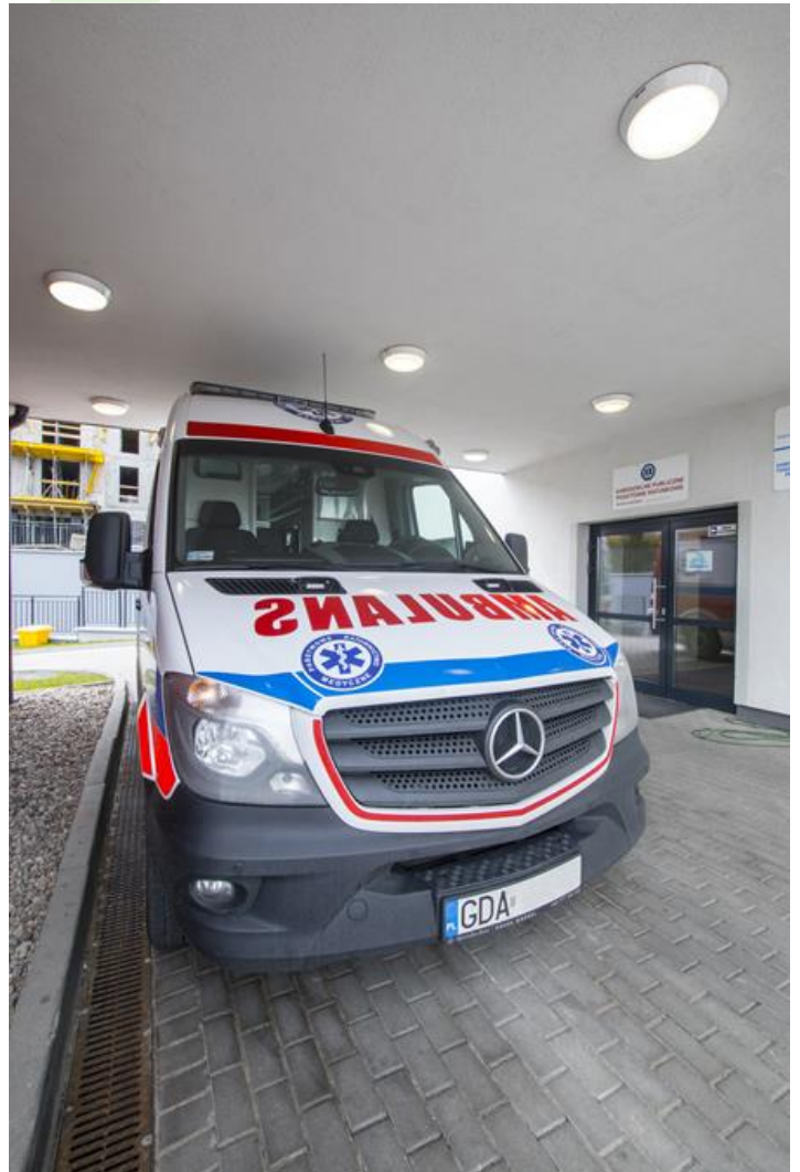
Emergency Medical Services, Pruszcz Gdański

Surface mounted or wall luminary equipped in highly efficient LED panels. Luminary body and diffuser made from IK10 impact resistant material. High level of protection against penetration of dust and water - IP65. Luminary recommended for: bathrooms, wards, medical staff room.