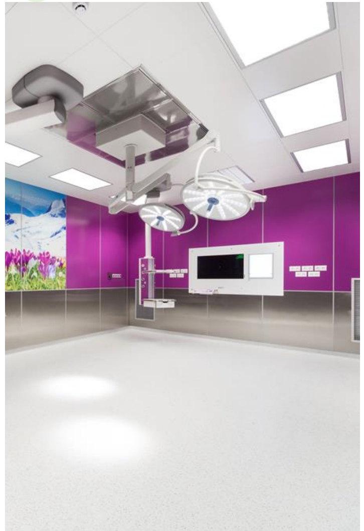
Surgery Room, Korfantów

Luminaire designed to module and gypsum and cardboard suspended ceilings, equipped with the highly efficient LED panels. Luminaire body made from steel sheet, powder coated in white. Optical systems and diffusers mounted in an aluminum frame. The product ensures a homogeneous distribution of light on the iris without shadows and lighter points directly below the LED sources. Luminaire recommended for: emergency departments, intensive care units, and treatment rooms.