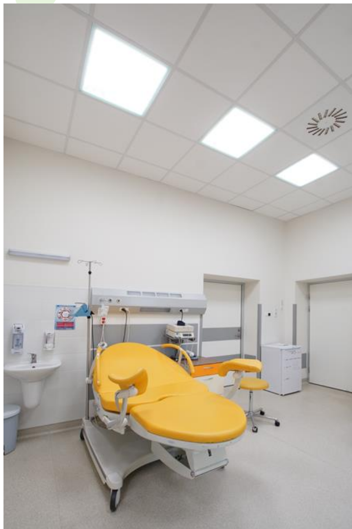
Maternity ward, Hospital in Goleniów

Luminaire designed to module suspended ceilings, equipped with highly efficient LED panels. Luminaire body made from steel sheet, powder coated in white. Its characteristic feature is lack of aluminum frame what allows to exclude the unwished-for contamination in clean rooms. There are no visible elements joining the diffuser and the luminaire body. Luminaire recommended for: operating and treatment rooms, as well as intensive care units.