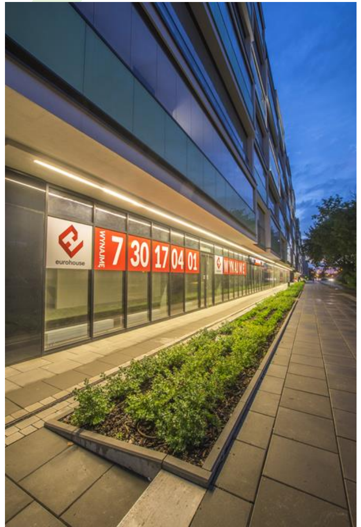
"Artystyczny Żoliborz" residential, Warsaw

The group of X-line luminaires is made of aluminum profile with opal diffuser or micro-prismatic diffuser. The luminaires may be joined with special connectors providing great freedom in arranging elements of the system and its functionality.