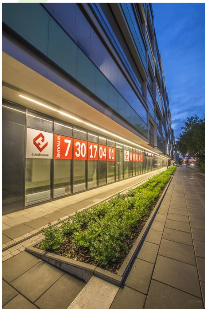
"Artystyczny Żoliborz" residential, Warsaw

The group of X-line luminaires is made of aluminum profile with opal diffuser or micro-prismatic diffuser. The luminaires may be joined with special connectors providing great freedom in arranging elements of the system and its functionality.