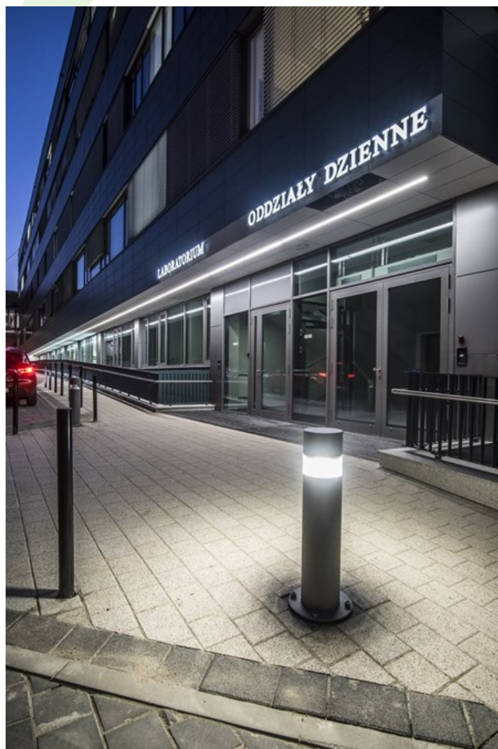
Center of Non-invasive Medicine, Gdańsk

Outdoor luminaire to be mounted on hard surface, equipped in the latest generation, highly efficient and energy saving LED sources. Aluminium made housing is corrosion resistant. Product is designated to efficient illumination of walking paths, parks, recreational areas, residential areas. Level of protection against penetration of dust, moisture and solids: IP65