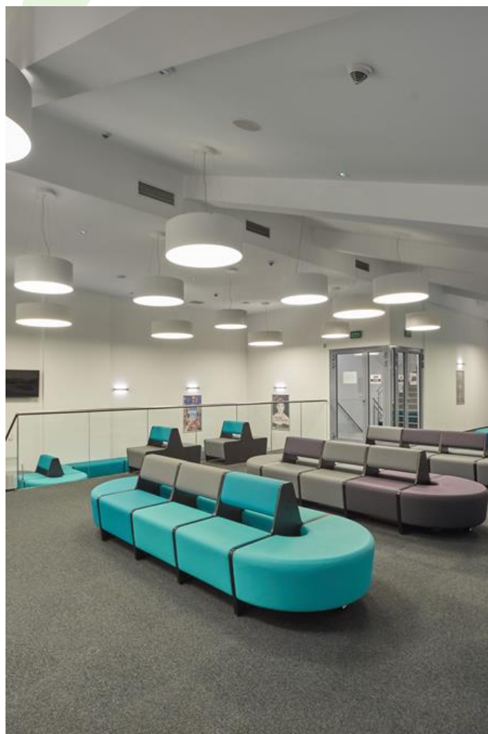
Cultural Center, Kozenice

The fitting is used in public buildings such as banks, offices, hotels, stores, schools, that is wherever pleasant environment is of special importance. Rubin O gives the interior style and individuality. The special construction of this fitting and its diffusers permit to restrict glare. The housing is made of steel plate, powder painted, diffusers applied are opal.