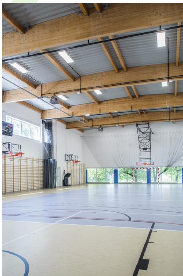
Primary School no1, Marki

Surface mounted luminary dedicated for the sports, gymnastics and squash halls, etc. Luminary equipped with the protecting grid made from steel wire powder coated. Diffuser used in the luminary provides less glare effect for the room users when compared to the light sources used in the fluorescents.