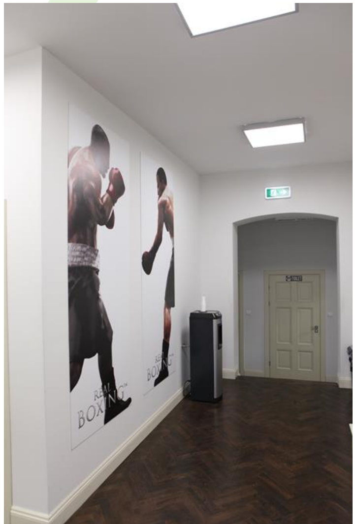
Vivid Games, Bydgoszcz

Surface mounted luminaire equipped in highly efficient LED sources. Luminaire body made from steel sheet, powder coated.