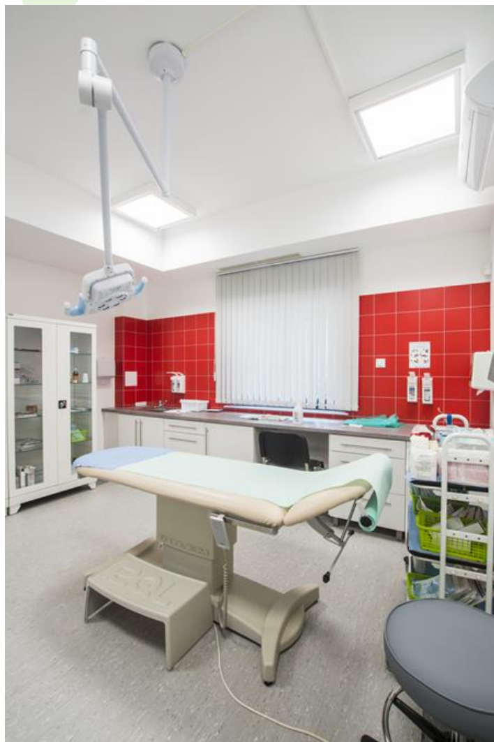
Emergency Medical Services, Pruszcz Gdański

Surface mounted luminaire equipped in highly efficient LED sources. Luminary body made from steel sheet, powder coated in white. Optical systems and diffusers mounted in an aluminum frame. The product ensures a homogeneous distribution of light on the iris without shadows and lighter points directly below the LED sources. Luminaire recommended for: emergency departments, intensive care units, and treatment rooms.