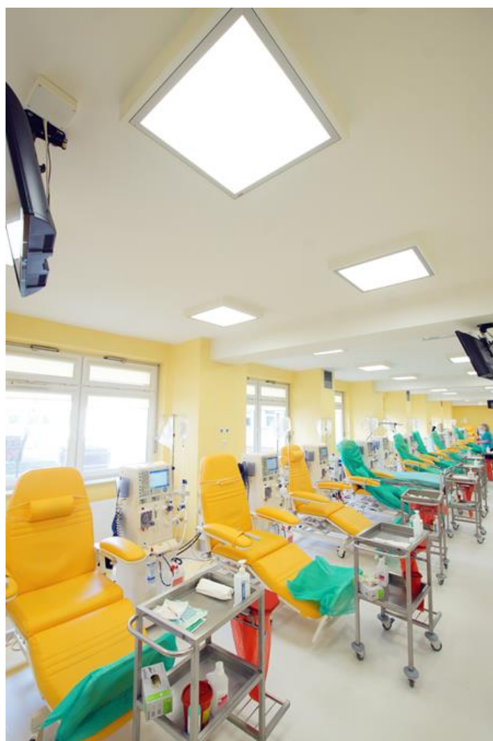
Dialysis station, hospital in Łomża

Luxiona Poland as the only company in Europe has obtained CRI>95 for its luminaires (it provides high level of R9 and R13 that faithfully render the color of blood and tissue). Luminary recommended for operating theatres - lighting that is applied should faithfully render the color of blood, tissue, and skin (R9 responsible for rendering „deep red” color, and R13 responsible for rendering „light orange” color). Surface mounted luminaire equipped in highly efficient LED panels. Luminary body made from steel sheet, powder coated in white. Diffusers and optical systems in aluminum frame.