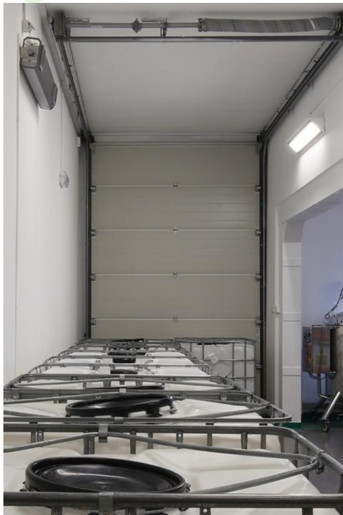
Cosmetics laboratory Dr Irena Eris, Piaseczno

Hermetic luminaire dedicated for clean rooms, and other health service structures. Luminaire to be surface mounted or in the walls and ceilings corners. LED sources of the high illumination efficacy. The luminaire body made from steel sheet powder coated in white. Its optical system is equipped with milk polycarbonate, or mat hardened glass diffuser. Luminaire recommended to all spaces with the hazards of its destruction. Accessories: steel mesh powder coated in white. Luminaire also available without the steel mesh.