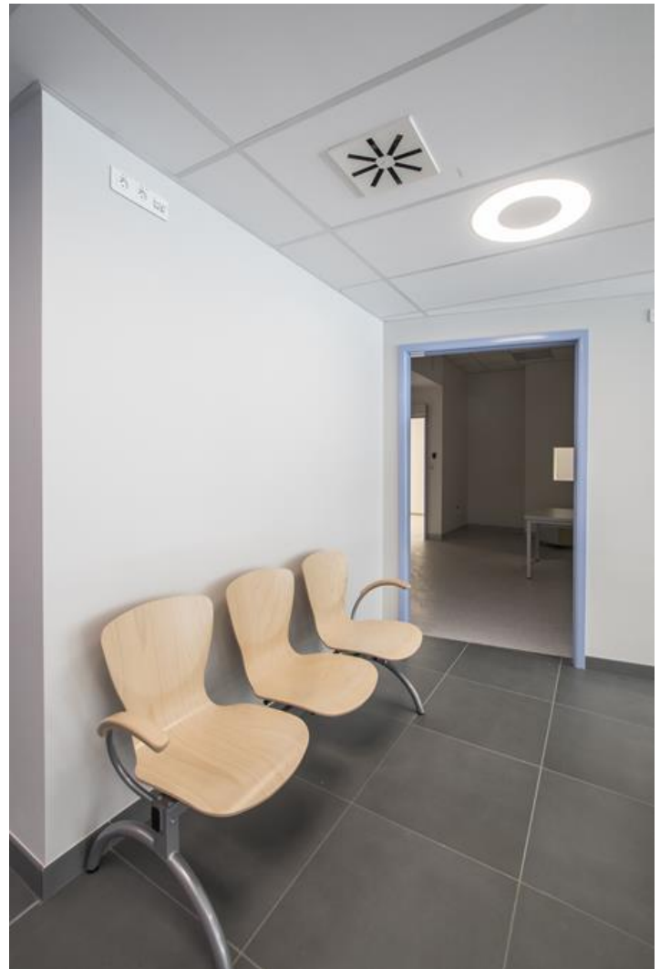
Center of Non-invasive Medicine, Gdańsk

Sophisticated luminary providing the effect of a lighting ring designed for plasterboard ceilings, equipped with highly efficient LED sources. The luminary provides possibility for unique illumination of interior. The color rendering indicator is Ra>80. Luminary body is made from powder coated steel sheet in white. The luminary diffuser is made from opal PMMA. Luminary is protected against water and dust penetration – IP43. It has the first class protection against the electric shock. It is possible to mount the luminary in modular ceilings, provided that the luminaire is suspended from the main ceiling. Security (links etc.) on the client side.