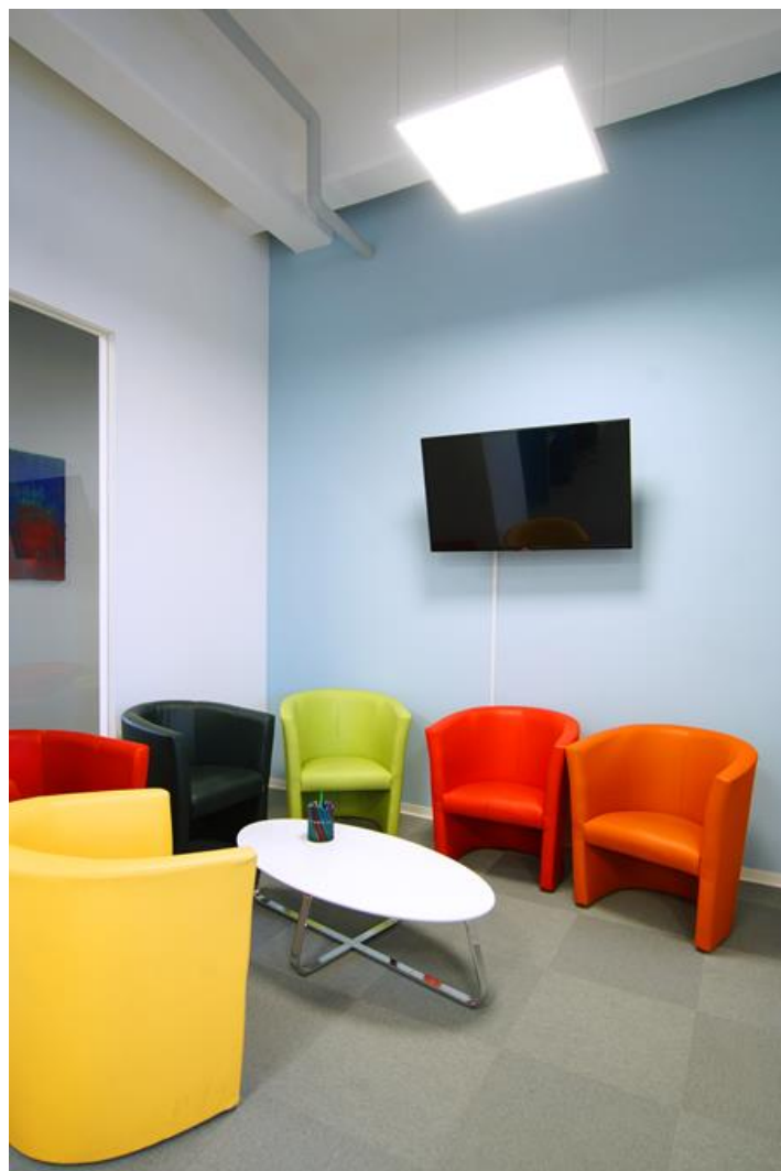
Language school "Eurasia", Berlin