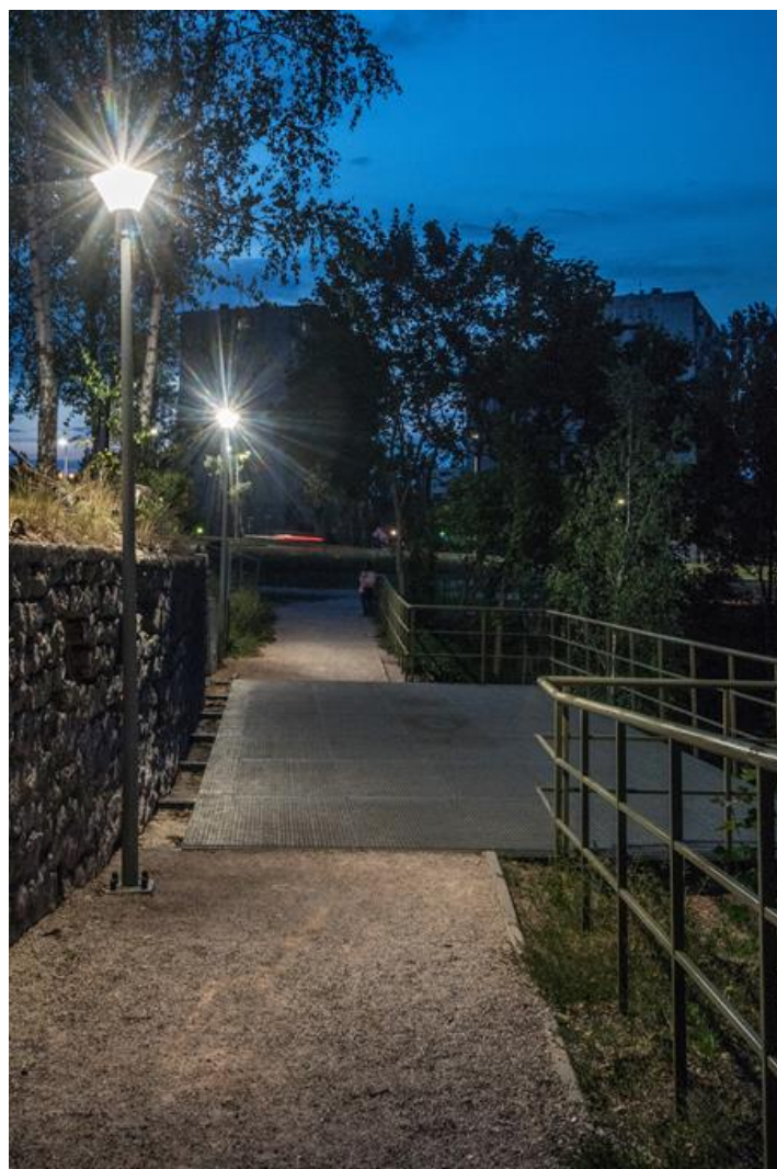
Kadzielnia Nature Reserve, Kielce

Outdoor luminaire dedicated for garden and parks, equipped with highly efficient LED sources. Body made from aluminum cast. Its transparent diffuser is made from polycarbonate which is highly resistant to mechanical factors – IK09. The outer cover provides a very high level of resistance to all atmospheric factors, as well as the luminaire aesthetical design during the whole exploitation process (IP54). Mounting diameter – 60 mm. Luminaire specially recommended to illuminate the squares, parks, and other open spaces.