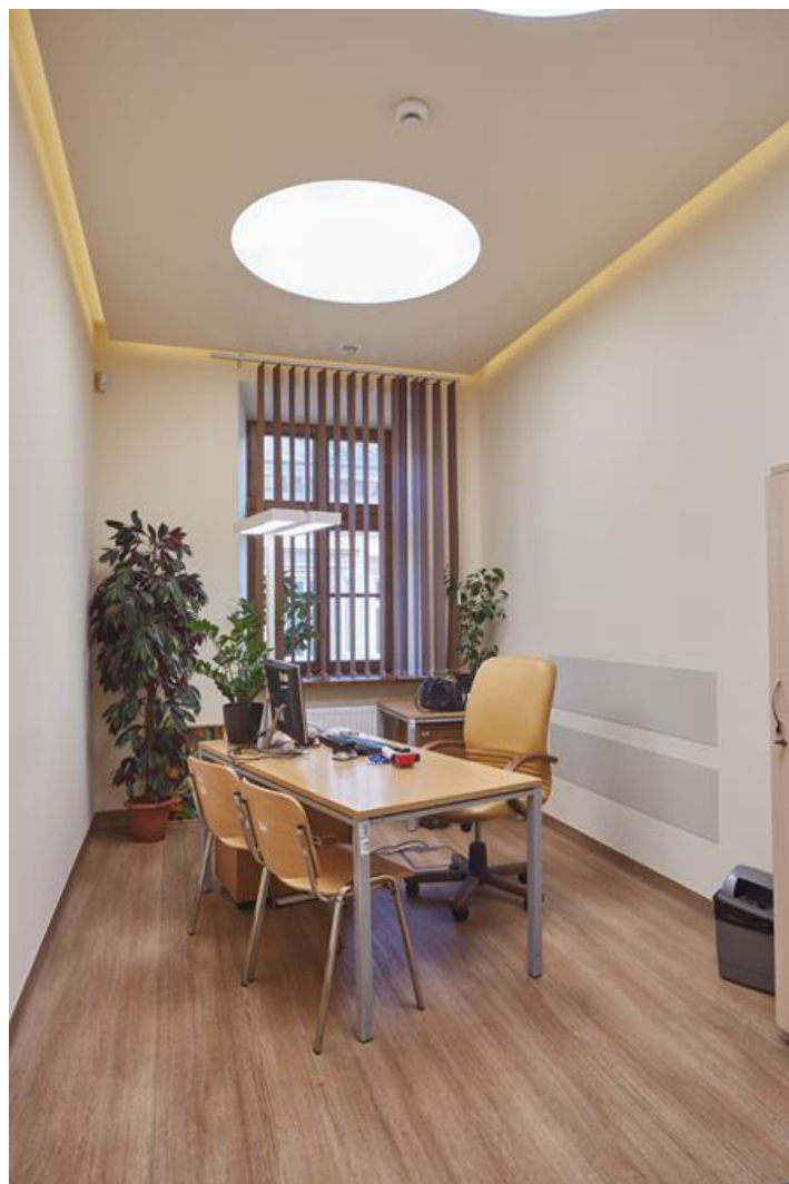
Tax Office, Kraków

Nowadays architectural lighting should embody an irreproachable style and high quality of lighting parameters. A luminaire is expected to be exceptional in respect of its design – simple and elegant. Patos is designed for lighting galleries, museums, offices, clubs, restaurants and hotels; it gives any interior individual modern character. Fitting designed for suspended plasterboard ceilings, adapted to befit the ceiling surface. Body made of aluminium profile, prismatic diffuser with very good light transmission coefficient and light diffusion parameters. Mounting should take place before the ceiling surface is finished. After the finishing work of the ceiling is ended, the diffuser is installed. LED modules adjusted to regulate the color temperature of light in the range from 2700 K to 6500 K.