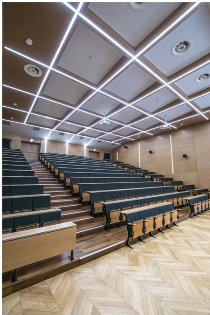
Nicolaus Copernicus University, Toruń

Nowadays architectural lighting should embody an irreproachable style and high quality of lighting parameters. A luminaire is expected to be exceptional in respect of its design – simple and elegant. Patos is designed for lighting galleries, museums, offices, clubs, restaurants and hotels; it gives any interior individual modern character. Fitting designed for suspended plasterboard ceilings, adapted to befit the ceiling surface. Body made of aluminium profile, prismatic diffuser with very good light transmission coefficient and light diffusion parameters. Mounting should take place before the ceiling surface is finished. After the finishing work of the ceiling is ended, the diffuser is installed.