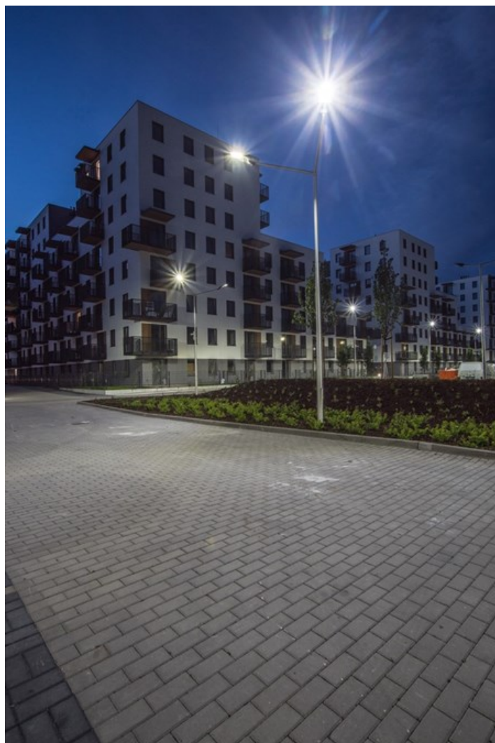
Osiedle na Woli, Warsaw

Powder painted aluminum cast housing highly weather proof. Luminaire is equipped with adjustable handle designed for mounting on posts and arms of 60 mm diameter. Level of tightness IP66. Diffuser is made of hardened glass. Following color temperatures are available: 5700 K. It is possible to program an autonomous multi-level or manual power reduction for specific customer needs by using a specialized power supply in the luminaire. The luminaires have overvoltage protection as standard based on the functionality of the power supplies. Optionally, the luminaires can be equipped with an additional voltage surge protector that does not require interference during the assembly and disassembly of the power supply system. *Selected luminary variants are available with ENEC certificate.