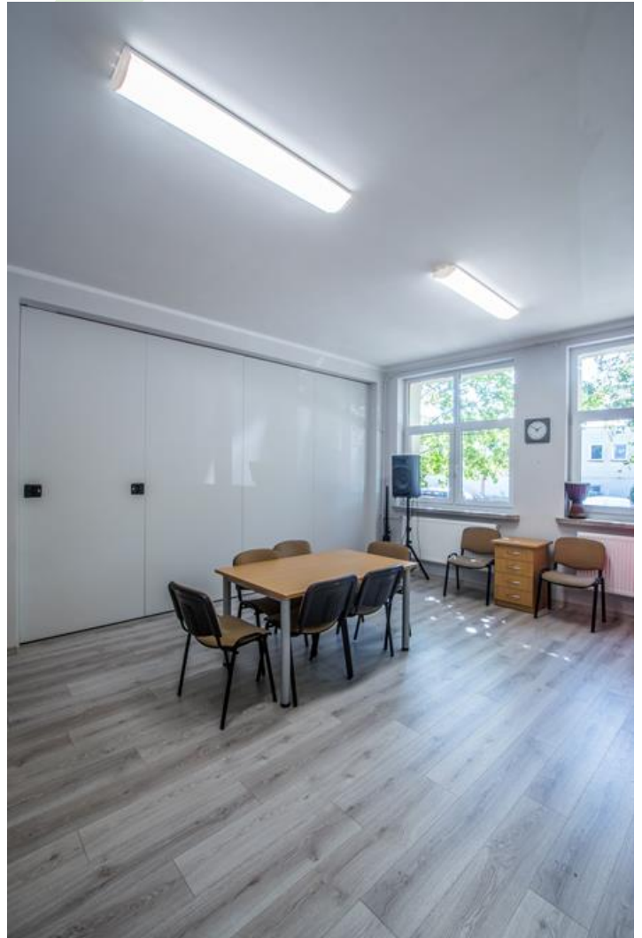
Environmental House of self-help, Białystok

Surface mounted luminaires equipped with highly efficient LED sources. Luminaire base made from powder coated steel sheet. Lampshade made from the opal version of methyl polymethacrylate. Luminaire mounted directly on ceilings by raw plugs.